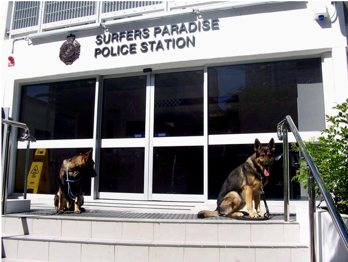
During the Cadiva course in Qld