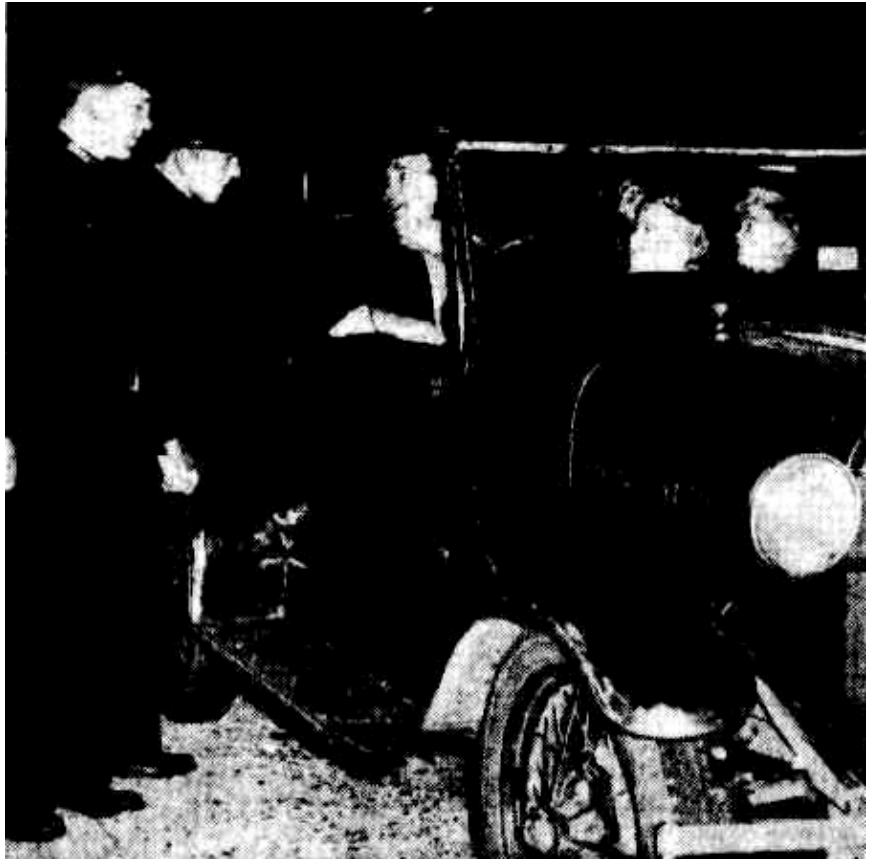
A detective-sergeant checking his rifle before joining the search. A spotlight was attached to the barrel of the gun.