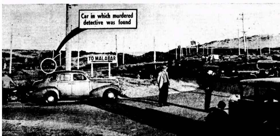
ABOVE: The scene at Matraville yesterday