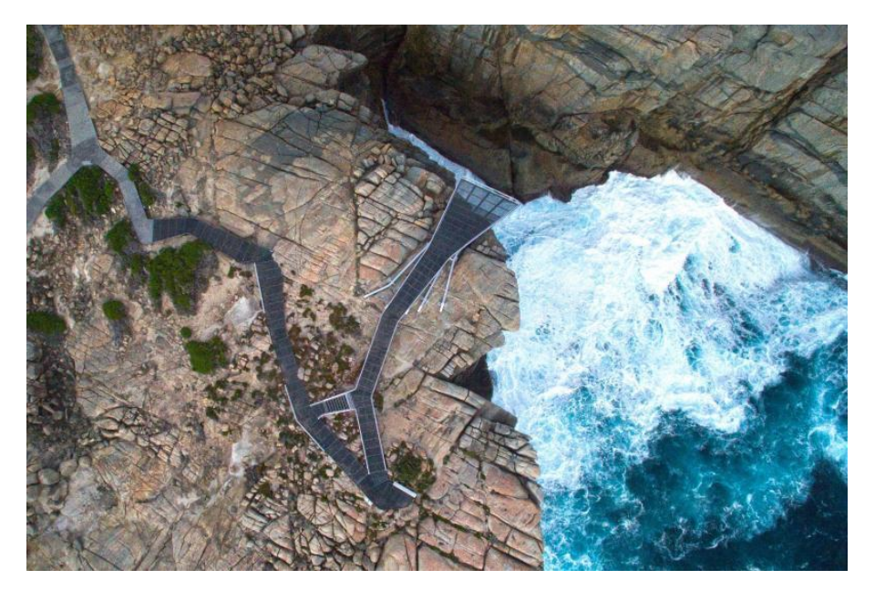
Photo 2: Aerial view of the walkway and platform at The Gap<sup>7</sup>